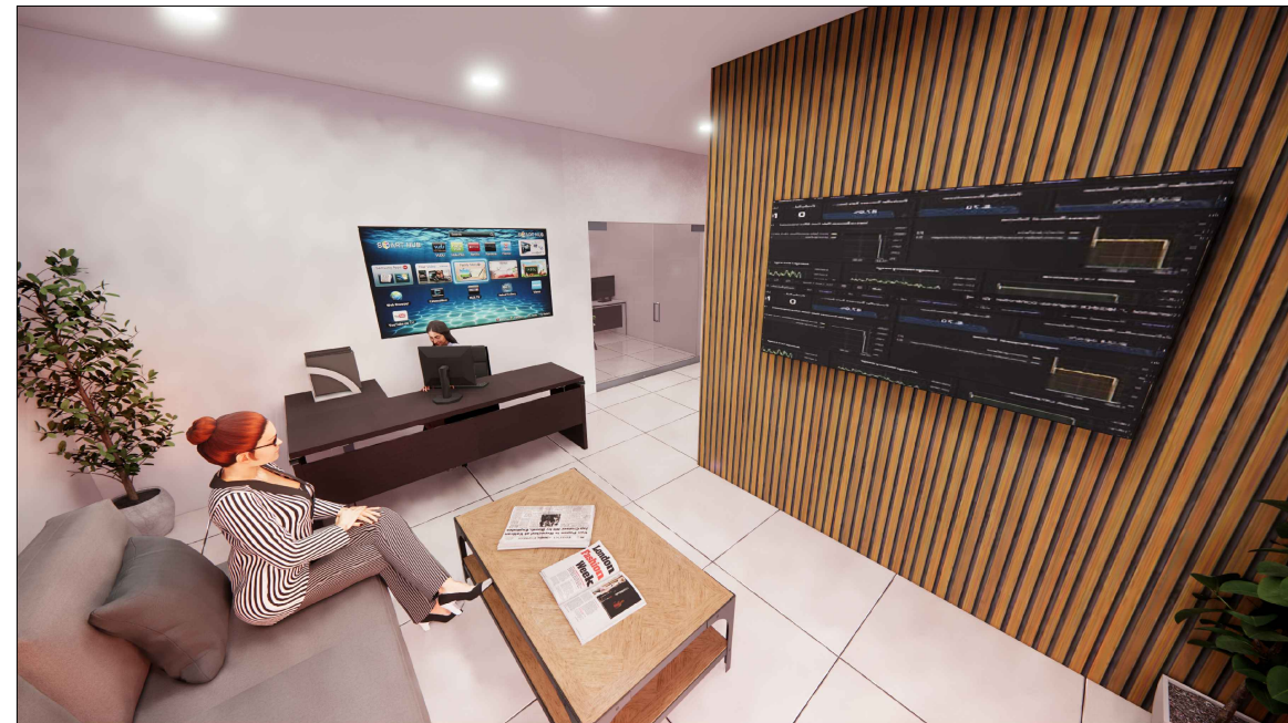
WAITING AREA PERSPECTIVE "A"