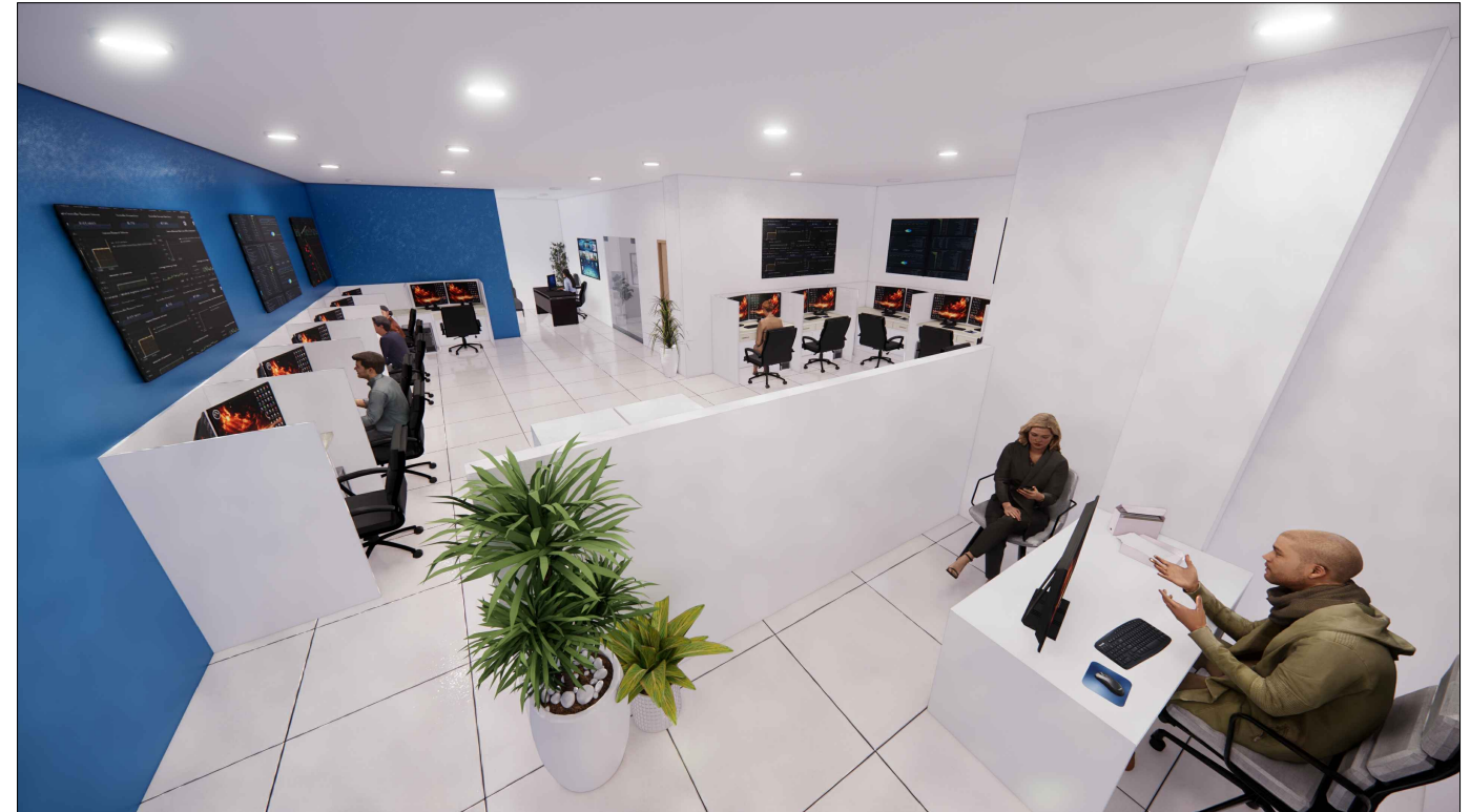
WORKING STATIONS PERSPECTIVE "E"