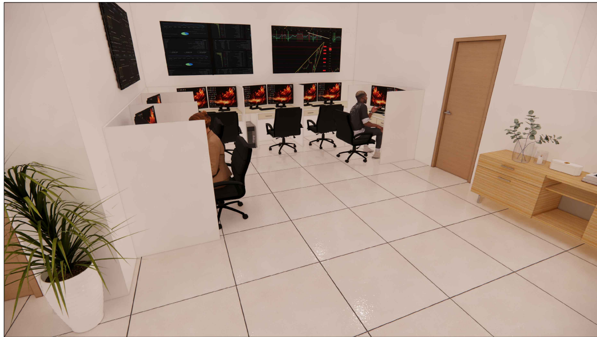
WORKING AREA 2 PERSPECTIVE "C"