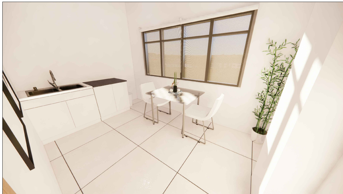
PANTRY PERSPECTIVE "D"